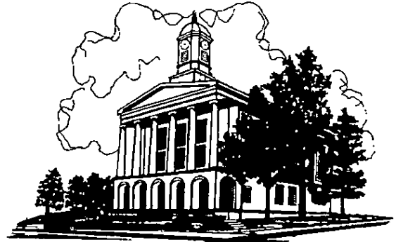
SUSQUEHANNA COUNTY COURT HOUSE MONTROSE, PENNSYLVANIA